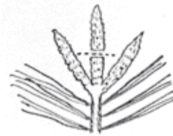
Pruning top shoot (terminal) of a pine, "candle" stage (left)