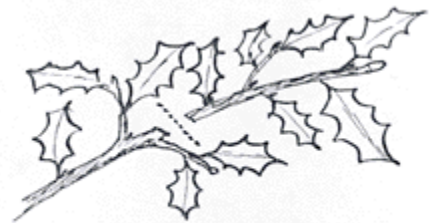
Pruning the side branch of a holly in winter or early spring.