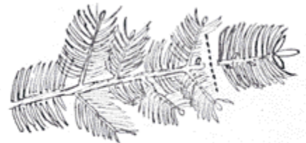
Pruning the side branch of a spruce in the early spring.