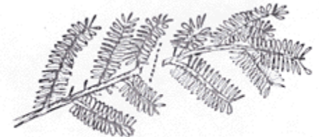
Pruning the side branch of a hemlock in the early spring.

9. The MAHONIA and LEUCOTHOE Group. These are rather slow-growing, and require little annual pruning, but if pruning is necessary, do it immediately after these plants flower in the spring.